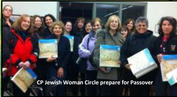
CP Jewish Woman Circle prepare for Passover