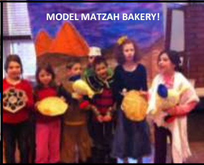
MODEL MATZAH BAKERY!